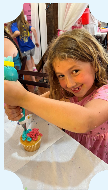
2023 Double Stellar Seller Event