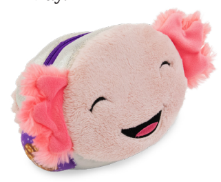
175+ Packages sold through Digital Cookie Axolotl Zipper Pouch