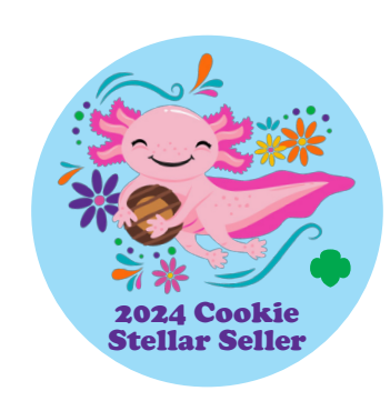
1,200+ Packages Stellar Seller Celebration at Magic Mountain in in 2024