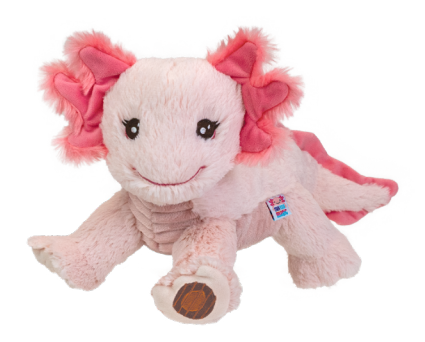
245+ Packages Axolotl Plush OR $5 Reward Card OR The Shoe That Grows – 1/2 shoe