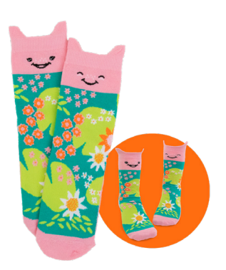
200+ Packages Axolotl Socks OR $5 Reward Card

Girl Scouts earn these rewards based on their total packages achieved by the end of the cookie program.