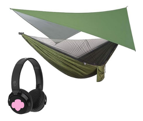
900+ Packages Hammock Tent & LED Lights OR Skullcandy Bluetooth Headphones OR $20 Reward Card OR The Shoe That Grows – 1 pair