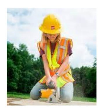
Tools - Hand and Power